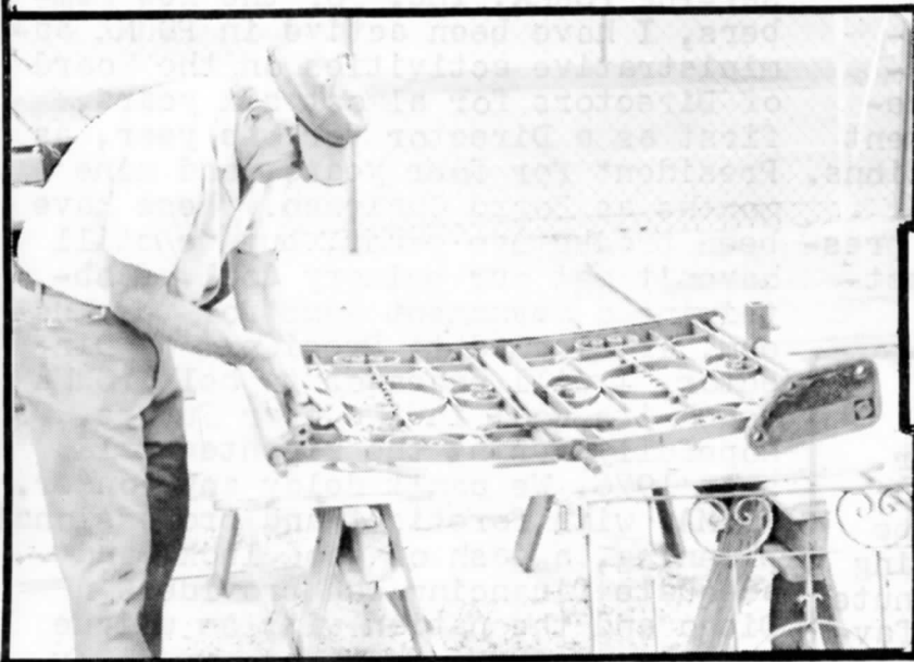
Some of the activity at the car 1509 restoration session, July 26th. Why weren't YOU there?