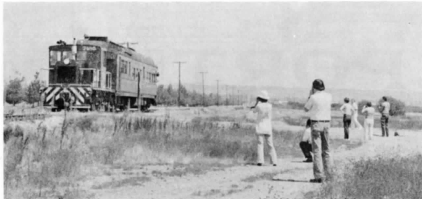
Camera shutters click at one of several photo run-bys staged for the fans out in the Miramar "boondocks".