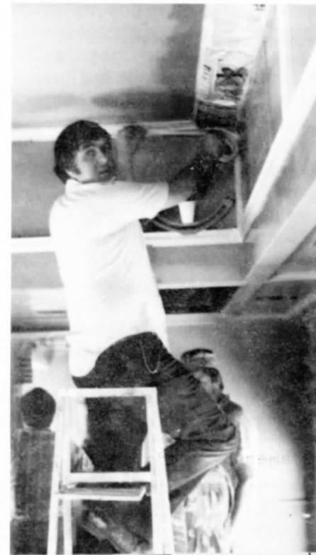
Museum Gen. Mgr. masks the ceiling trim in #1509.