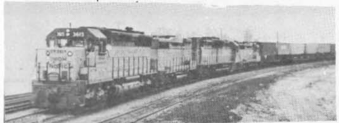
Union Pacific SD-45 #3615 leads a consist of fellow EMD diesels eastbound through Devore at the base of Cajon Pass. Following #3615 is GP-30B #720B, DD-35 #75, and GP-30 #807 in this June 6, 1969 afternoon scene.